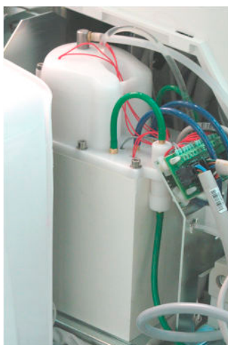
Figure 1. The Water Hygienization Equipment (W.H.E.) device inside a dental unit, at the inlet of the municipal water.

Both the continuous device and the discontinuous system can be provided as built-in systems in new dental units or later integrated in many models of the same manufacturer (Figure 1).